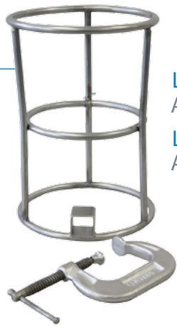
LipoFilter Stand ASP-CAN-2R